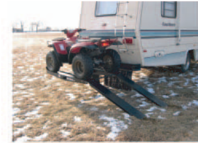
VH-90RO in use.