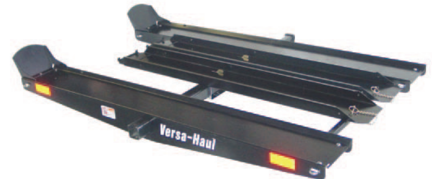
Assembled VH-90 carrier with RK