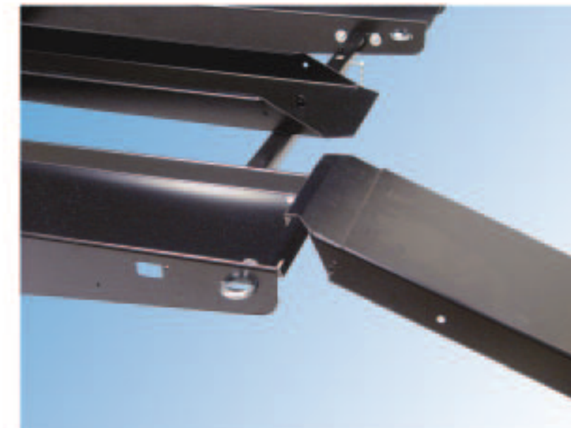
Attaching the Ramp.